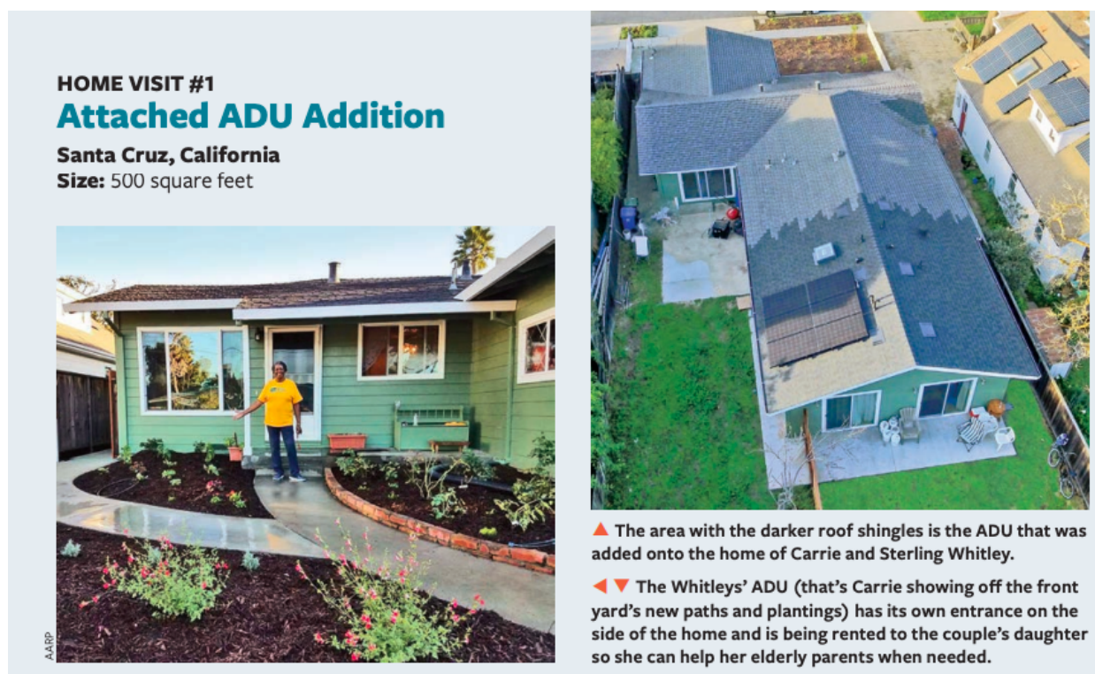
The Whitley family extended their home into the backyard and created an ADU with a separate entrance for their daughter, who can now help her elderly parents when needed. ADU's are often invisible from view because they're positioned behind or are tucked within a larger home